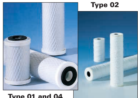
Type 01 and 04

Retention ratings 2 -1: 1 µm -2: 5 µm -3: 10 µm