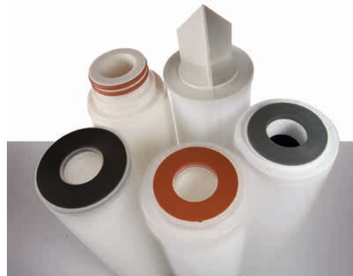
LOFPLEAT GG filter cartridges are available with a variety of gasket, O-ring and end cap configurations.

* For liquids other than water, multiply pressure drop by fluid viscosity in centipoise.